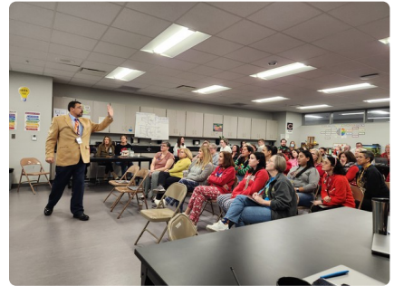
Walking Alongside Komarek District 94 for Professional Learning