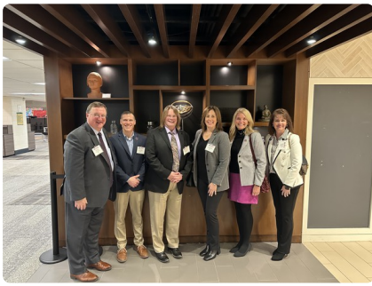
Members of West40 Leadership Team at the EdRed Legislative Dinner