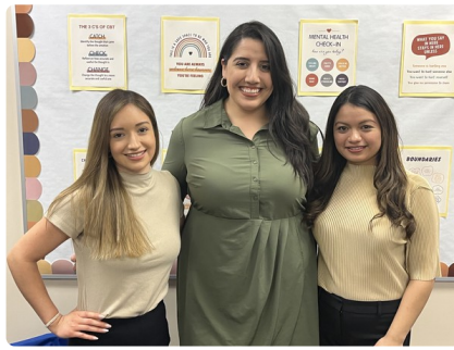
Student Advocates at Mannheim Middle School