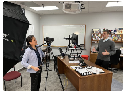
Communications Team Recording a Story of Change