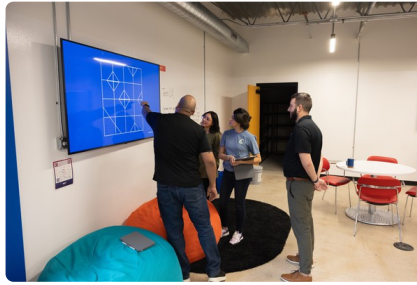
Learning to Think Differently at "Today at West40"